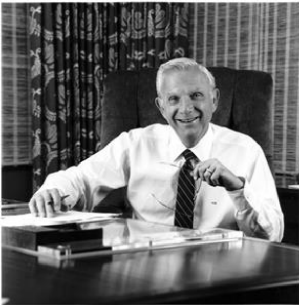
This media asset is free for editorial broadcast, print, online and radio use. It is restricted for use for other purposes.