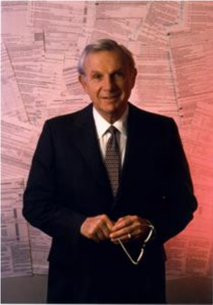
This media asset is free for editorial broadcast, print, online and radio use. It is restricted for use for other purposes.