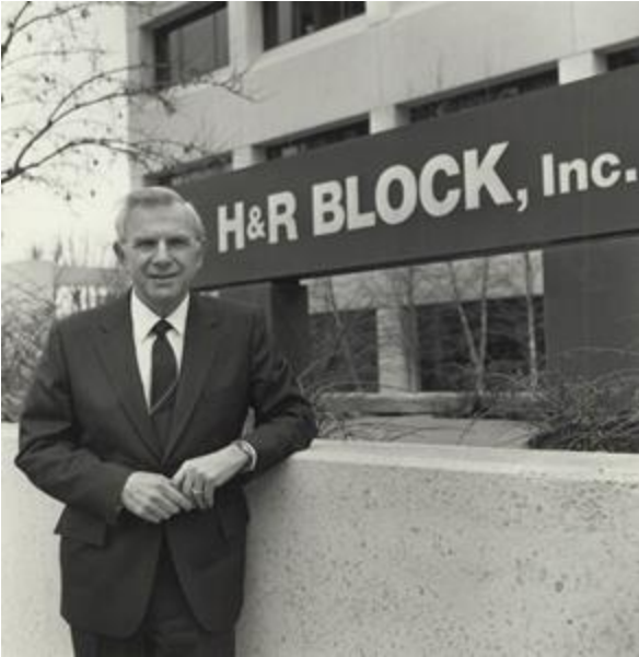
This media asset is free for editorial broadcast, print, online and radio use. It is restricted for use for other purposes.