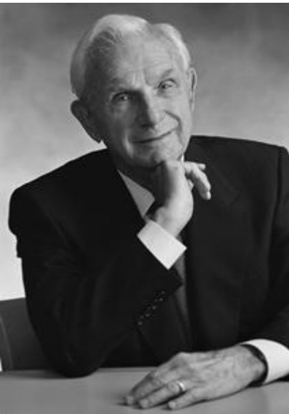
This media asset is free for editorial broadcast, print, online and radio use. It is restricted for use for other purposes.