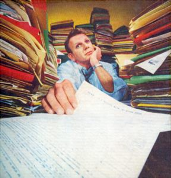
This media asset is free for editorial broadcast, print, online and radio use. It is restricted for use for other purposes.